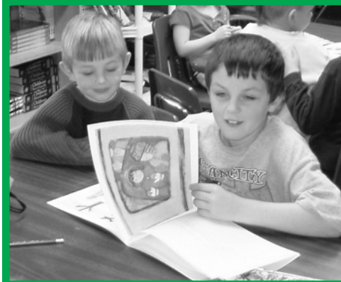
Otisville third grade students work on a book project together.

Our school district participates in the federally assisted National School Breakfast and Lunch Program. This means that students whose family income falls within prescribed limits may participate in the breakfast and/or lunch program free of charge or at the reduced rate of $.25 per meal . The state publishes income eligibility guidelines, based on household size, each school year. To learn if your child is eligible for free or reduced price meals, you can go to the district's website at www.minisink.com (forms/publications, free and reduced meal application) or contact the district registrar, Mrs. Ann Shand, at 355-5812. We encourage all eligible families to take advantage of this very beneficial program.