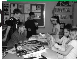
Students learn about Braille.