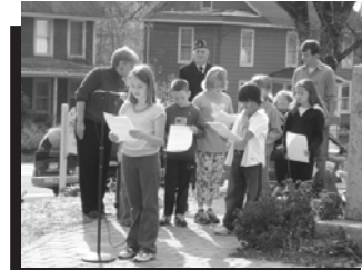
Students participate in a Veteran's Day Memorial Service.